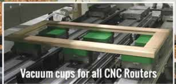
Vacuum cups for all CNC Routers