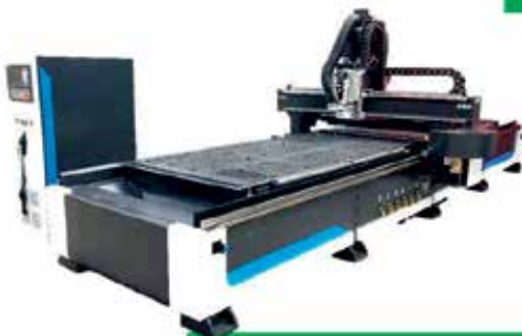
TWIN-408 Twin Table 4' x 8' CNC Router $43,990.00