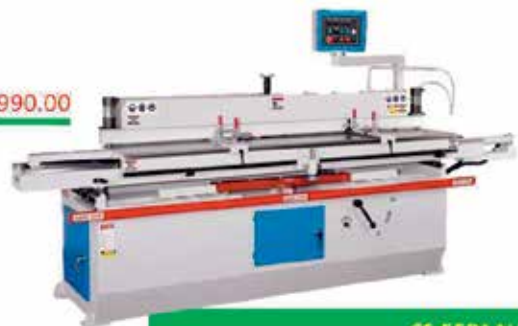
CS-55PAAU 55" Auto Raised Panel Door Shaper $23,900.00

Castaly Industries Corp. FULFILLING ALL YOUR MACHINERY NEEDS