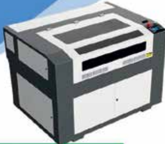
CLC-3624 36" x 24" Engraving Laser $5,690.00

With the enthusiasm and passion of woodworking, Castaly Machinery offer the machines to allow woodworkers to create more with less cost. The featured tools are engineered with multi-functions that bring out the best quality and easy adaption. Contact us for more details!