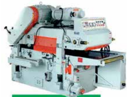
PL-18 18" Two Side Planer with Straight Knife Cutter $19,990.00