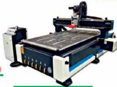
Basic-408 Basic 4' x 8' CNC Router $12,990.00