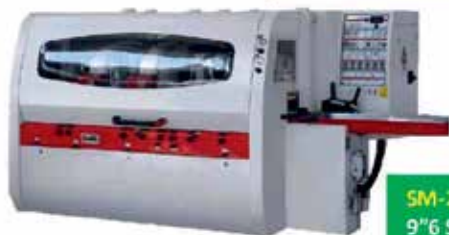
SM-236A 9"6 Spindle Moulder $32,900.00