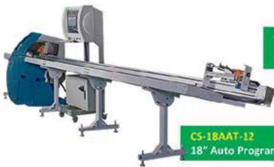
CS-18AAT-12 18" Auto Program 12FT Cut Off Saw $22,990.00