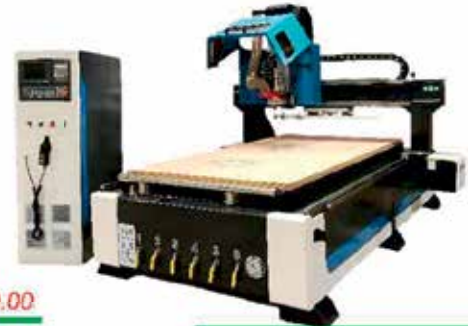
Rapid-510-LN12 Rapid 5' x 10' CNC Router (Linear Auto Tool Change) $36,990.00