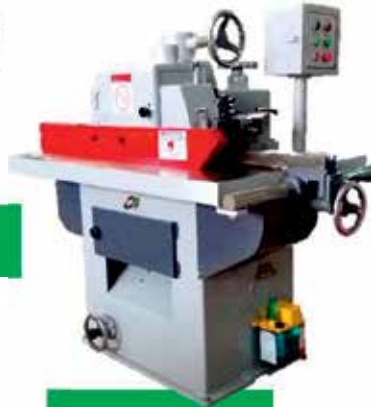
TRS-0016 16" Single Rip Saw $13,990.00